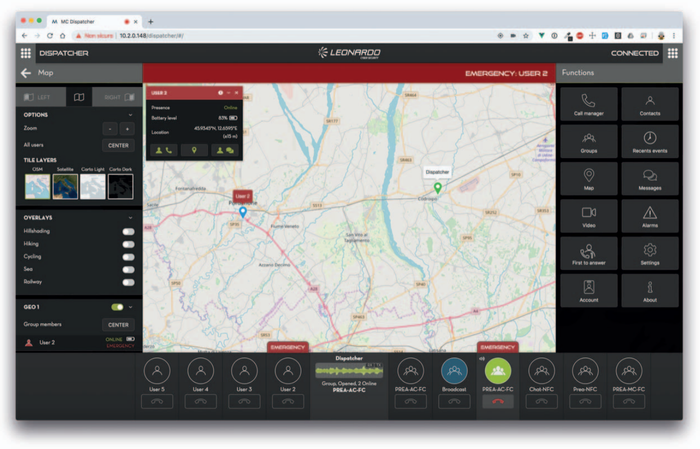
Dispatcher user interface