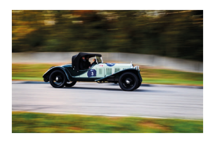
1000 MIGLIA ERA CAR CLASS 1927 – 1957